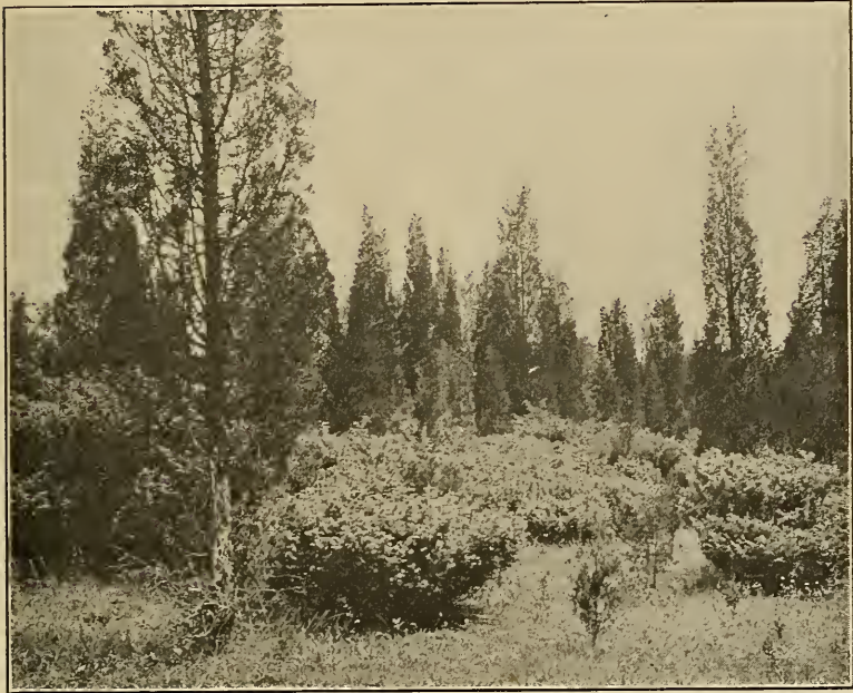
FIG. 9. A typical "old field" society in an abandoned pasture; New Haven. Juniperus virginiana and Juniperus communis var. depressa .

although there may be some divergence in the shrub stage, due to the local abundance or scarcity of particular species. But the tree stages in different sections exhibit some appreciable dissimilarities. Reference has been made in previous papers* to variations in the composition of the climax forest. The earlier tree stages as well manifest certain differences. Gray birch is a common pioneer tree in all sections, but post oak is confined to